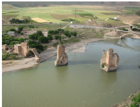
Hassankyef, a majestic beauty needs to be saved