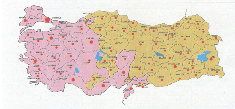
Figure 2.14. Development Priority Provinces